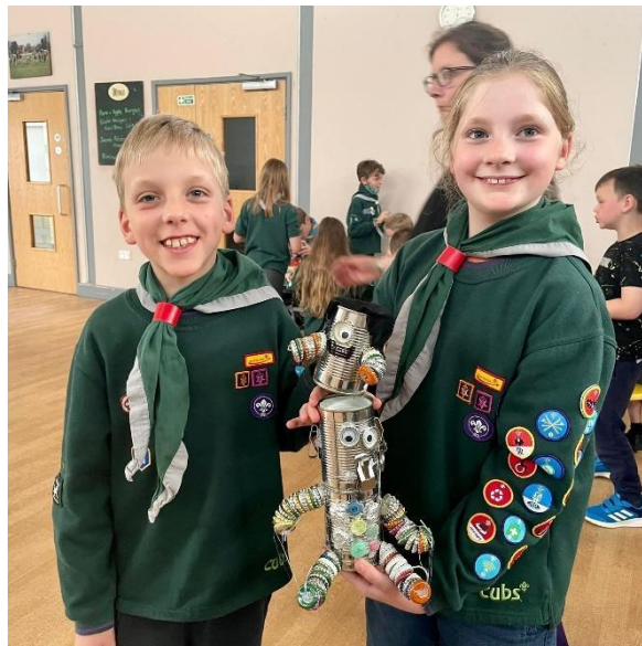
Patrol Leader Training.

overdue, no thanks to the pandemic and lockdown restrictions, Patrol Leader/Assistant